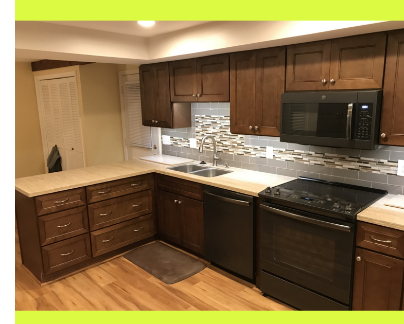
An "Easy-flow Kitchen" with dark & rich earth-tones accented in cool greys.