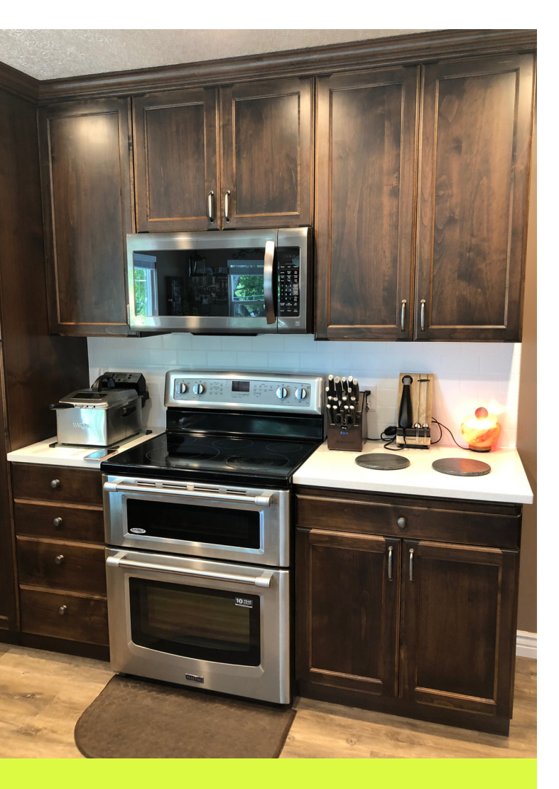
An efficient cook center allows multiple food items to be baked, cooked, microwaved, brewed and toasted at the same time.

And re-facing alone does not solve the problem of broken, worn or sticky rollers and mechanisms on drawers. Another huge benefit of all new cabinets and drawers, is that we can make them deeper, larger and more functional than your current ones."