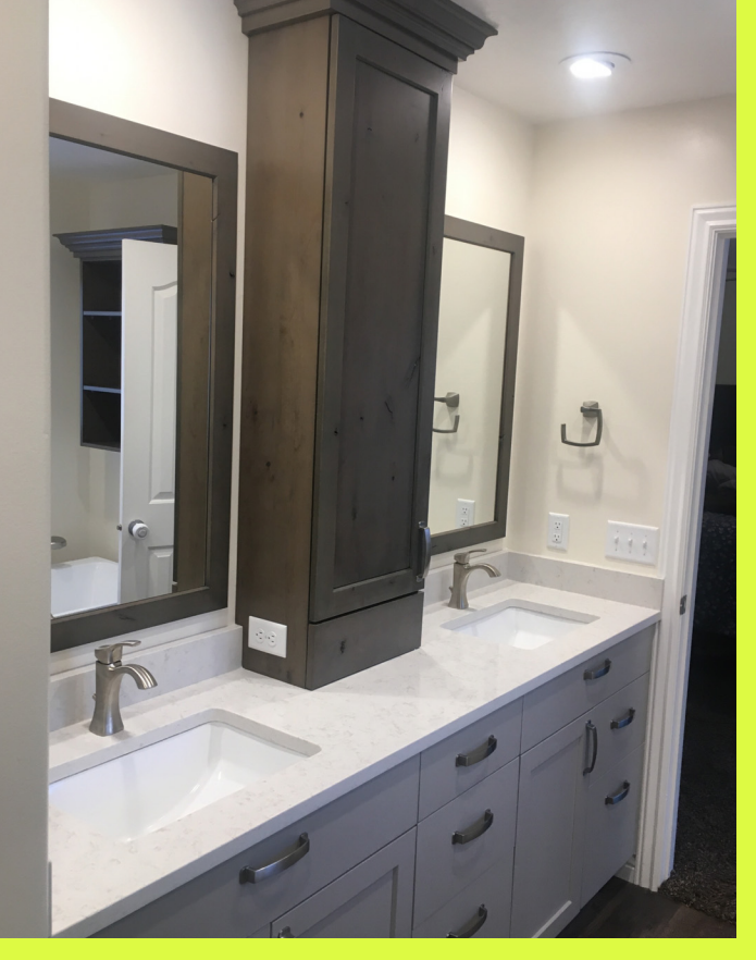
Another bathroom for two with a more