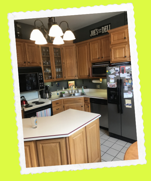
A refreshing change from "Casual Country" to "Organized Modern" fits well in the new century.