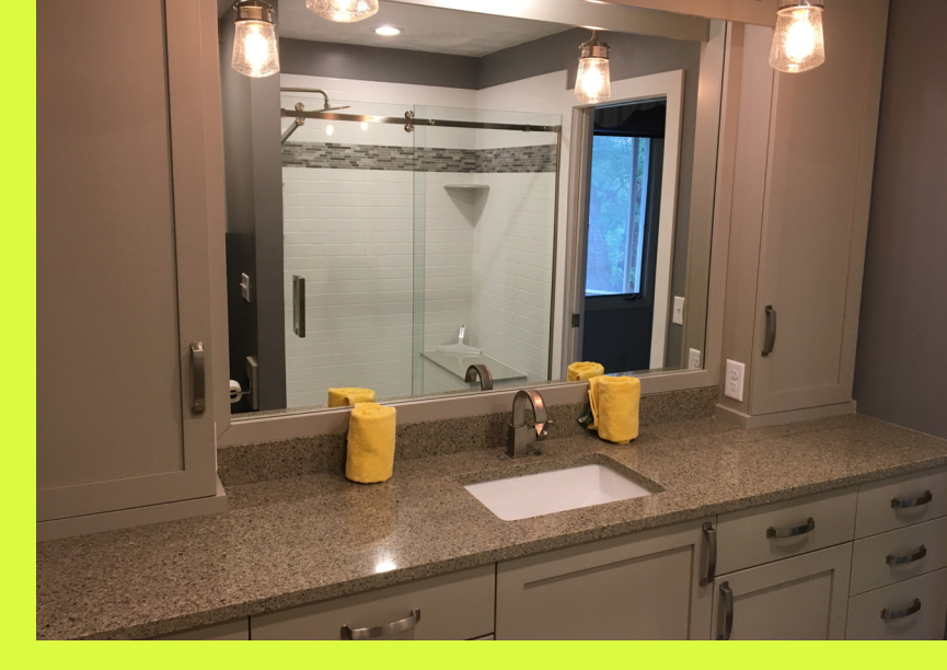
Enjoy the Ultimate Shower in a Soothing Bathroom styled in both warm and cool tones.

"The other night we had a large gathering with 38 people in attendance. My new kitchen design facilitated the feeding of that many people. On top of that it with the new design and materials it was so easy to clean up afterward."