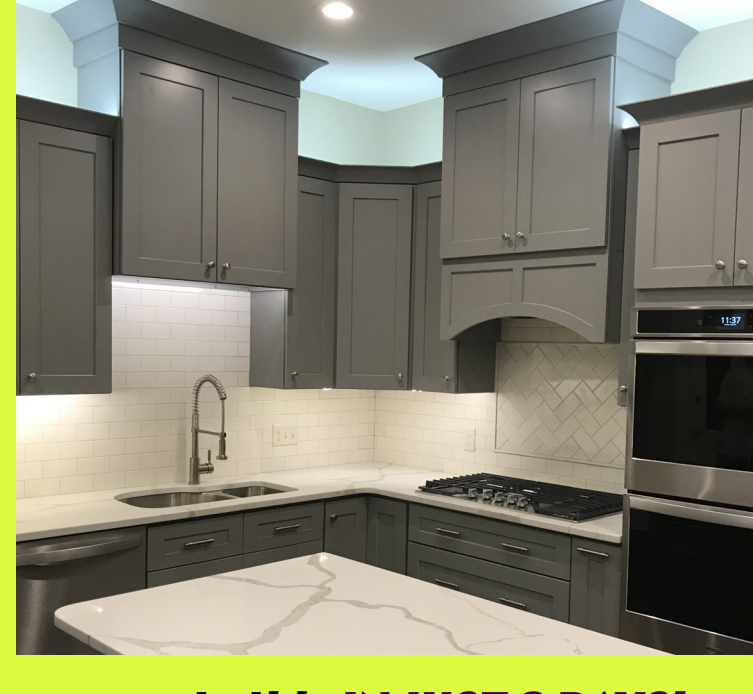
to this IN JUST 3 DAYS!