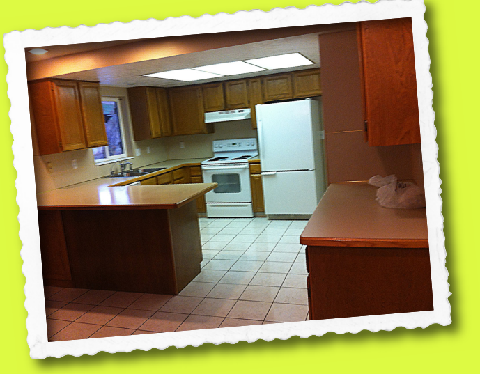
Outdated Kitchen Before